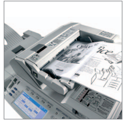
Concurrent front/rear function with DOUBLE SCANNER