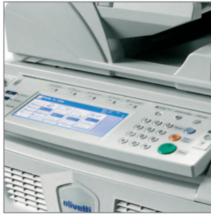
SLOPE-ADJUSTABLE and easy accessible console