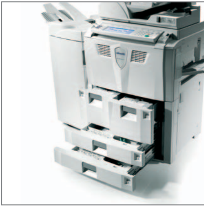
LARGE PAPER RESERVE with availability of up to 8,100 sheet